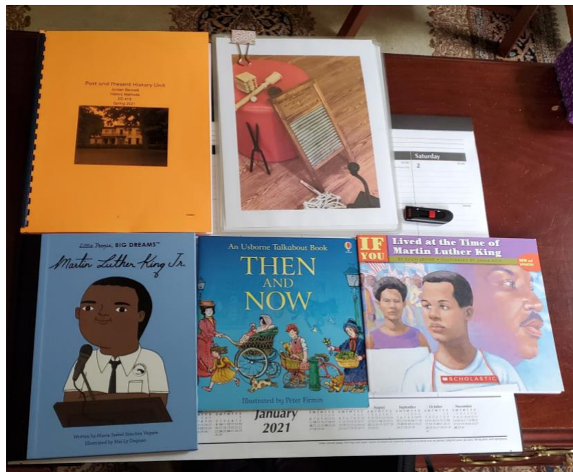
The bound copy of the lesson plans for this unit includes instructions for assessments and supplemental activities. Each lesson plan tote from the DMFAH also includes 3 - 4 related children's books.