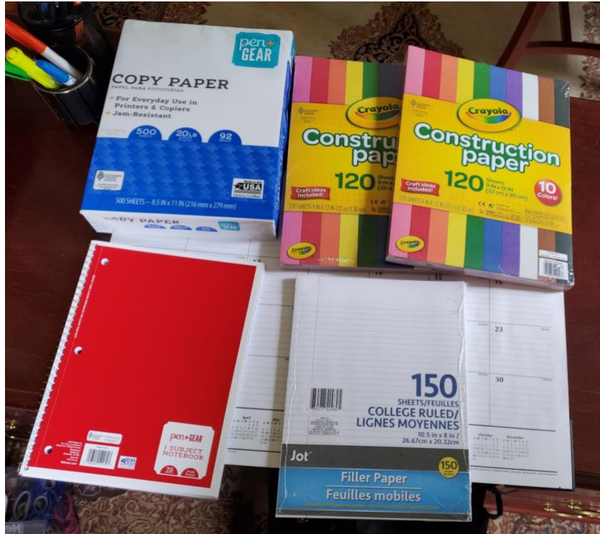
Paper included: Copy Paper, Construction Paper, Ruled Paper and a spiral Notebook.